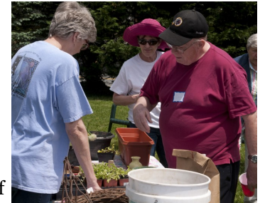
Choosing a plant at the “swap”