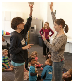
Doing yoga together

Also, there is gentle yoga for Village members and children. Our first session at the Silver Spring Day School was great fun. A dozen Villagers laughed, sang, and posed with a dozen four- and five-year olds. We plan to offer more of these classes in the fall.